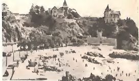
One of the Bochas at Viña del Mar

Paris, on a smaller scale, with a seating capacity of fifteen hundred. The Cervantes is an exquisite and aristocratic little hall; its five hundred comfortable "fauteuils" are all on one slightly inclined floor. The platform is wood-paneled and the acoustics excellent. It lends itself admirably to recitals and lectures.